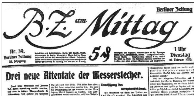
Illustration III. Headline of the BZ am Mittag , 16 February 1909